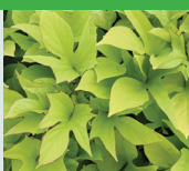
Yellow Sweet Potato