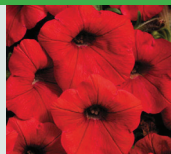
Red Velour Wave