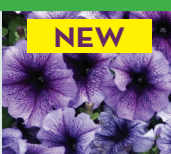
Blue Vein Wave