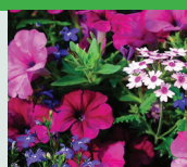
Night in Pompeii