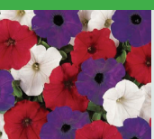
Red, White & Blue