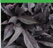
Black Sweet Potato