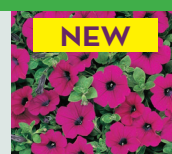
Electric Lilac Wave