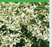
Diamond Frost Euphorbia