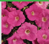
Pink Passion Wave