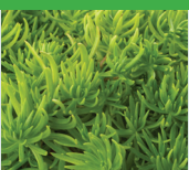
Lemon Coral Sedum