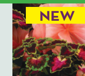
Iconia Miss Montreal Combo