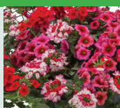
Little Piece of my Heart