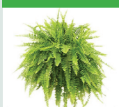
10" Boston Fern