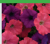
Blue, Coral & Pink